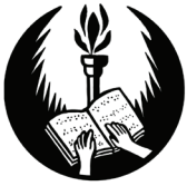
Union of the Blind of Montenegro