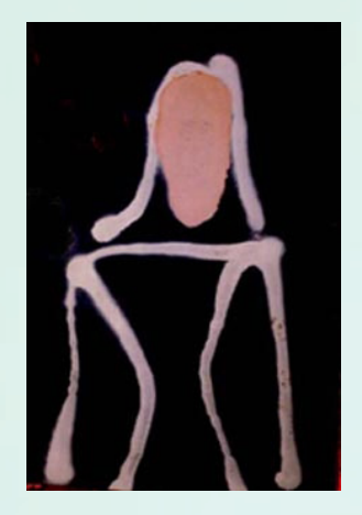
Alimony – the right of each child and an obligation of each parent , implemented by the NGO Shelter from Podgorica

The overall objective of the project is to contribute to the establishment of the comprehensive legislation and procedures, as well as to raise awareness about the problem of not giving the mandatory support for the children. In specific, the project aims to improve the level of understanding of the problem related to alimony and to produce recommendations for efficient and effective realization of the right of children to alimony with broad mobilization of diverse social actors.