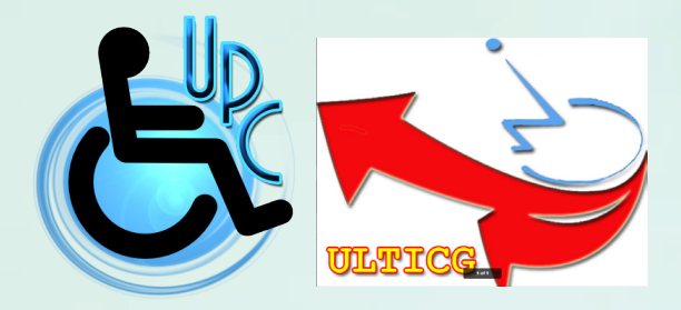
My right – right to free movement, implemented by the Association of Paraplegics Cetinje (partner: Association of persons with physical disabilities of Montenegro)

The overall objective is to improve the position of persons with disabilities in Royal Capital of Cetinje. In specific, the project is related to the improvement of legislation in order to promote the physical accessibility of publi buildings for access and movement of persons with reduced mobility and persons with disabilities.