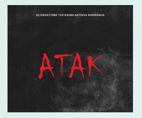
Cadre– contact, implemented by the NGO Atak Podgorica

The overall objective of the project is to create a social environment with equal opportunities for all citizens of Montenegro in the realization of their human rights, with particular emphasis on marginalized groups. In specific, the project aims to ensure active participation of persons with physical disabilities (mainly those who are blind and visually impaired persons) in cultural and art life of Montenegro.