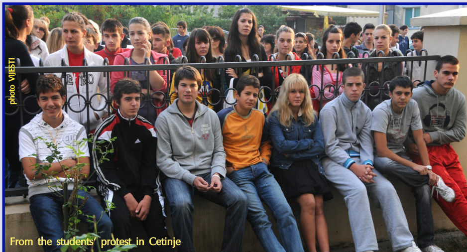
From the students' protest in Cetinje