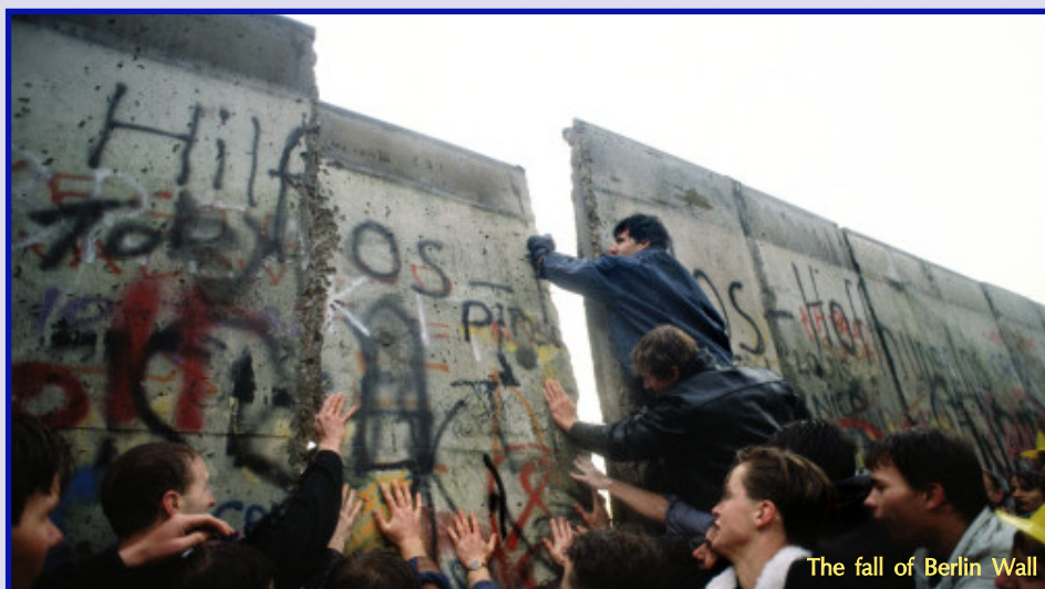
The fall of Berlin Wall

Unready to tackle this issue, EU representatives offered Belgrade and Podgorica a temporary solution in the form of establishment of a State Union of Serbia and Montenegro. The Union was created for a period of three years after which both members had the right to