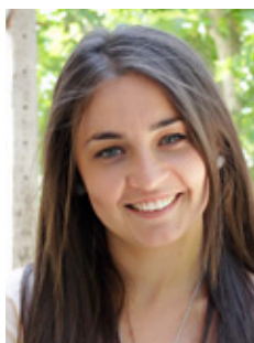
By: Svetlana Pešić

By the end of the decade the European Union will invest nearly 80 billion euro into science and education. HORIZON 2020 is the biggest science financing system in the world, and is designed to boost the competitiveness of European science vis-a-vis the rest of the world. The programme offers grants to participants from all sectors – the academic community, state institutions, private sector, small and medium enterprises, associations, non-governmental organisations etc. who choose to focus on innovation and marketable science and research activities. It consists of three pillars: Excellence in science, Industrial Leadership and Social Challenges. This structure allows for access to funding in various areas, as the money is to be distributed through programme units. Thus, an applicant will be able to draw part of the money from one and part from another research area. Special attention will be given to regions with less developed science infrastructure and small and medium enterprises, which should account for about 20% of total funding.