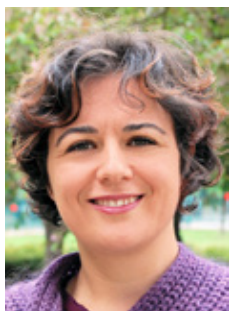
By: Arola Elbasani

What do the Western Balkan countries have in common two decades after the violent ethnic conflicts that characterised the dissolution of Yugoslavia, and more than a decade into the use of enlargement conditionality? Why do they still lag behind and show resistance to substantial sectors of the Copenhagen criteria?