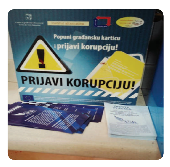
Photo 2: Box for anonymous reporting of corruption and accompanying promotional materials of the APC

It was assessed by visitors that in many municipalities officials are not in possession of information relating to procedures for reporting of corruption cases, nor are they familiar with whether there are clearly prescribed procedures in municipality, nor did they know whom to refer them to in order to acquire additional information.