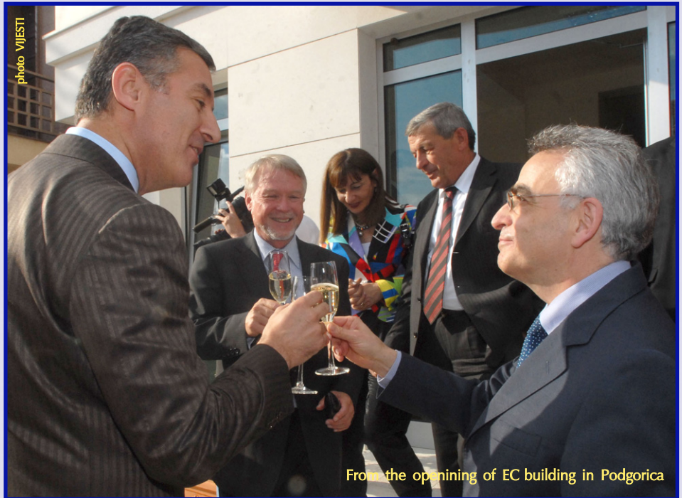
From the opening of EC building in Podgorica

• NGO sector, or rather the National Council for European Integrations (NCEI), has criticized EC saying that Report contains technical errors. For instance, the name of the NCEI has not been properly (that the name of the NCEI has not been