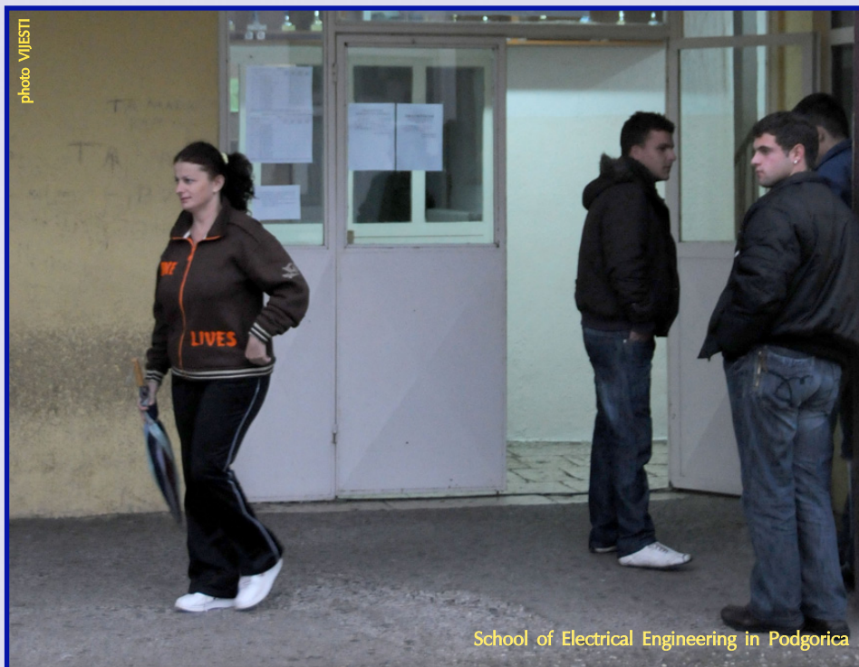
School of Electrical Engineering in Podgorica