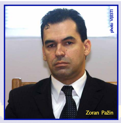
unbiased and immune to bribe.

According to the last CEDEM poll, only 26–29% of the citizens consider the judges to be "very" or "mostly"