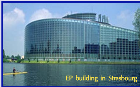
EP building in Strasbourg

The European Parliament can be described as one of the most important indicators of success of the integration processes within the EU, and perhaps the most obvious element of supra-nationality of this institution. Although assemblies or parliaments are not rare in other European inter-governmental organisations (Council of Europe, OSCE, etc.), their members are appointed by the national parliaments. European Parliament is the only international body whose members are elected by direct universal suffrage for a 5-year period, ever since the first elections in 1979.