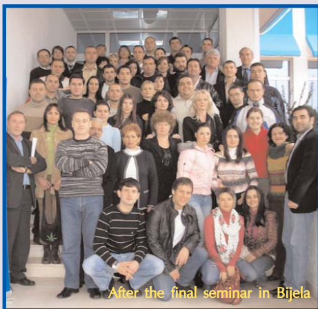
After the final seminar in Bijela

Another generation of the European Integration School successfully finished the programme, with the final exam taken on the 9 January.