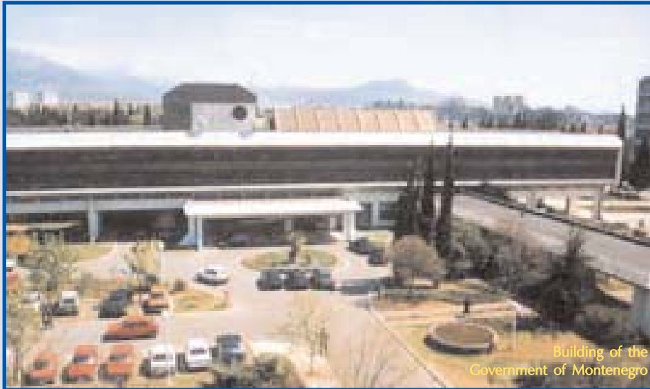
Building of the Government of Montenegro