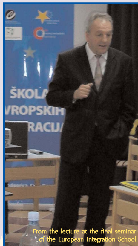
From the lecture at the final seminar of the European Integration School

Well, there you go, Macedonia was granted that status promptly after signing the SAA. It isn't necessarily a process that takes five or ten years, it can happen within two or three years. Slovenia signed its partnership agreement in 1996, and after a year and a half we