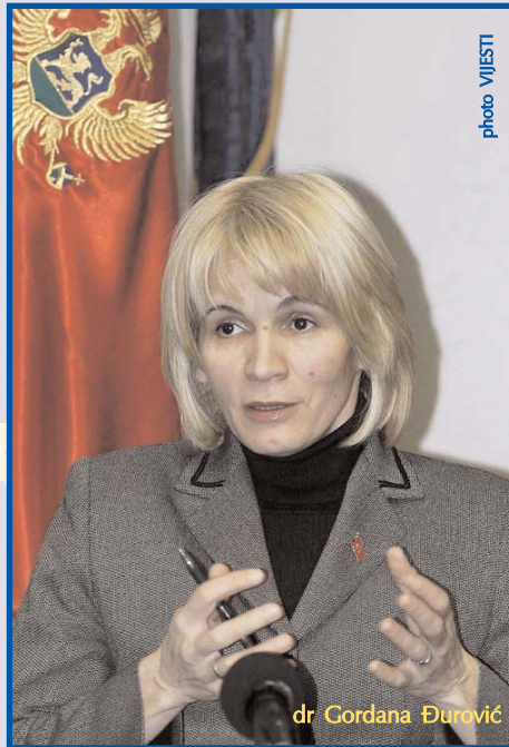
Recent report of the European Commissions on the progress of Serbia and Montenegro from No-

"Sustainable efforts are required... to secure development of a stable, professional, and independent government administration" reads one of the recommendations in this document.